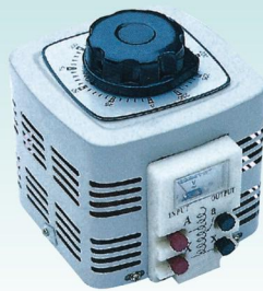
TDGC 2 -2KVA