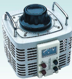
TDGC 2 -1KVA